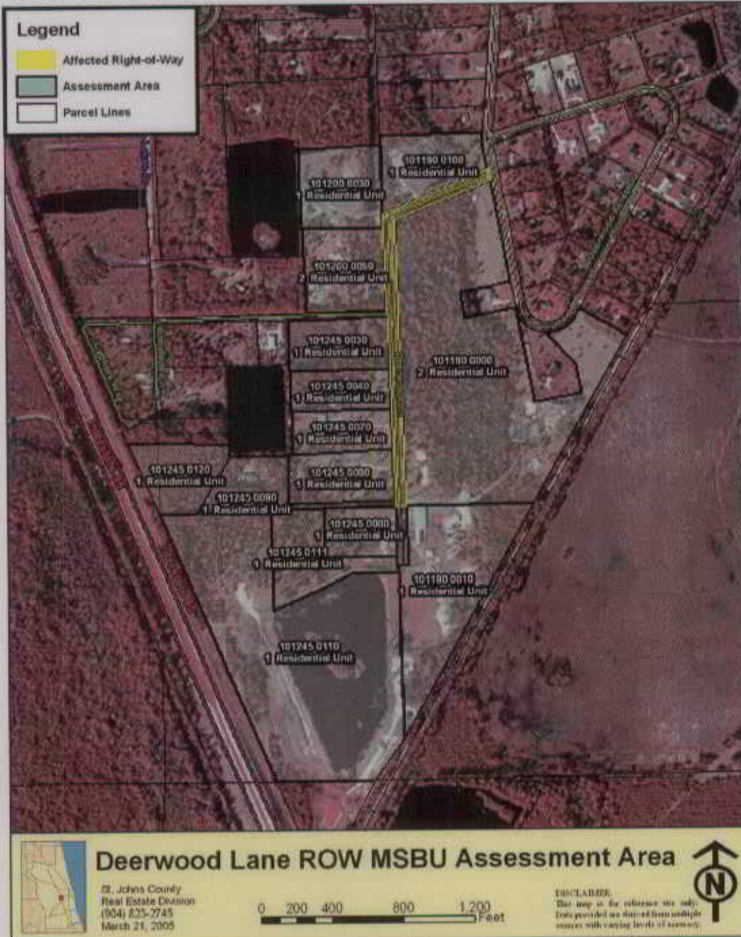
EXHIBIT "B" FOR THE RIGHT-OF-WAY ASSESSMENT RESOLUTION