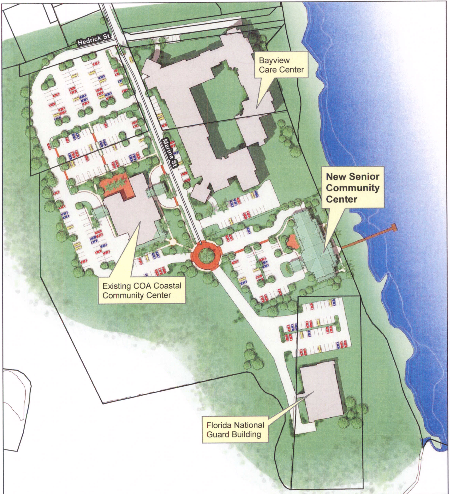
Exhibit "B" to Resolution