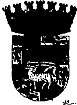
Exhibit "B" to Resolution