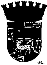
Exhibit "C" to Resolution