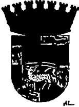
Exhibit "B" to Resolution