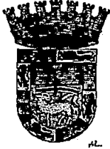
Exhibit "B" to Resolution