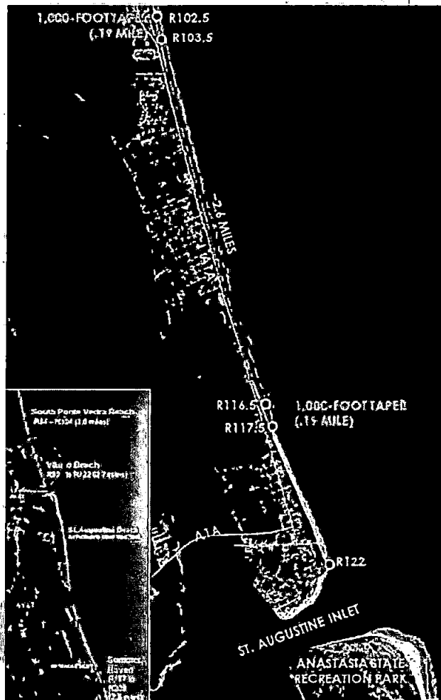
FIGURE 2 - PROJECT MAP