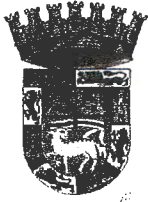
Exhibit "A" to the Resolution